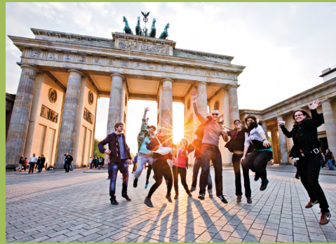
Illustration: © freepik.com, flaticon.com Photos: © ASH Berlin

The outstanding profile of ASH Berlin has developed out of the university's unique history and long tradition. Great importance is attached to diversity and gender mainstreaming, health promotion, a family-friendly environment, cultural activities and international exchange. By providing interdisciplinary study programmes and engaging in international networks, ASH Berlin opens up a wide range of professional prospects in the fields of social work, health and early childhood education.